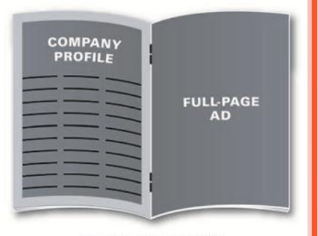
One-page company profile paired with full-page ad