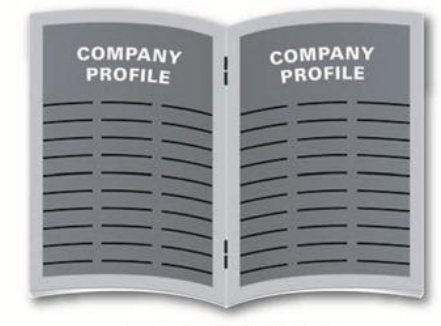
Two-page company profile